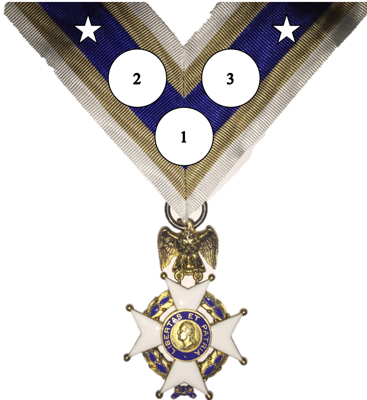
Figure 1. Placement of pins on SAR Neck Ribbon when facing wearer.